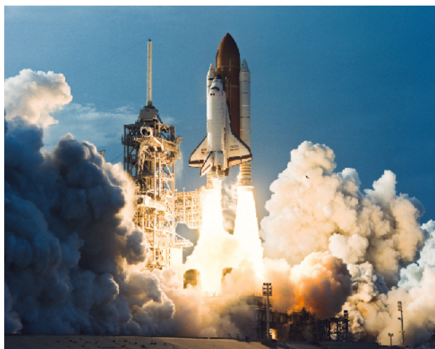
Figure 3.7 Demonstrating Newton's Third Law. The U.S. Space Shuttle (here launching Discovery ), powered by three fuel engines burning liquid oxygen and liquid hydrogen, with two solid fuel boosters, demonstrates Newton's third law.

This is the principle behind jet engines and rockets: the force that discharges the exhaust gases from the rear of the rocket is accompanied by the force that pushes the rocket forward. The exhaust gases need not push against air or Earth; a rocket actually operates best in a vacuum ( Figure 3.7 ).